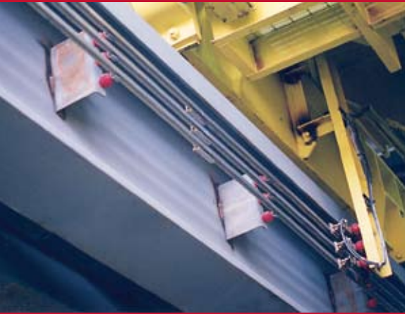
Shipping Bay Crane